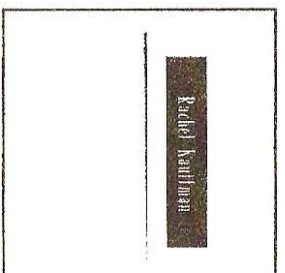
NAMEPLATE METAL PLATE WITH NAME ENGRAVED

Return this order form with a check for the amount below to your homeroom teacher by