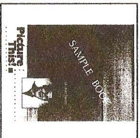
NEW!! PUT YOUR CHILD'S PICTURE AND NAME ON THE FRONT OF THE YEARBOOK!